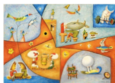
Takeo TAKEI “HOSHIYUBI - Starday” 1965, watercolor and crayon on paper, The ILF DOUGA Museum of Art