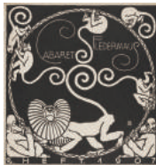
Cover of Programme «Cabaret Fledermaus» No. 2 (Cover design: Moritz Jung, Binding: Carl Otto Czeschka), 1907/ The National Museum of Modern Art, Kyoto Collection

In the late 19th century Vienna, artists represented by Gustav Klimt and Josef Hoffmann created numbers of outstanding works as they searched for new forms of art and design. Their innovative challenge is best expressed in the field of graphic design. This exhibition delivers the lively energy and charm of fin-de-siècle Vienna through over 300 graphic works and precious furniture from the same era from the collection of the National Museum of Modern Art, Kyoto.